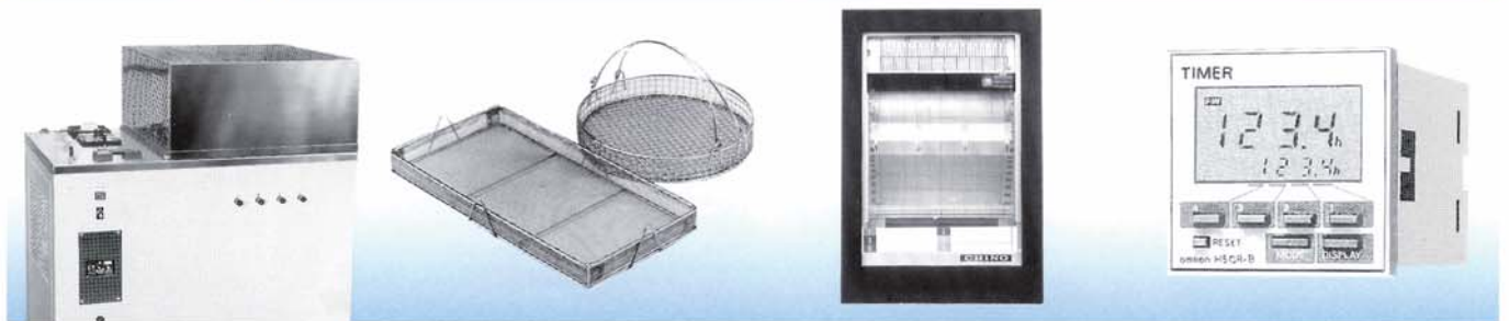
SAFETY LID COVER (EXCEPT 242HS-A)